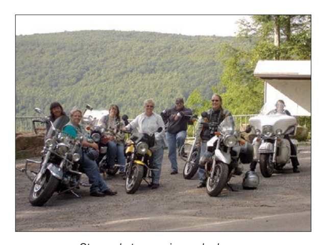
Stopped at a scenic overlook on a weekend getaway to Western PA

Presenting our annual Ride For HOPE proceeds to a worthy cause. Each t-shirt color represents a different year of giving.