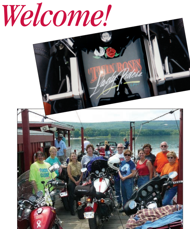
Crossing the Susquehanna River on the Millersburg Ferry