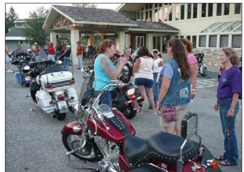
Mingling at a WOW® national rally