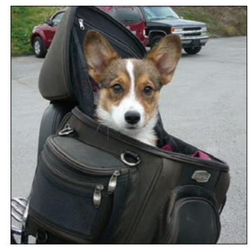
Alice says, "Come ride with us!"